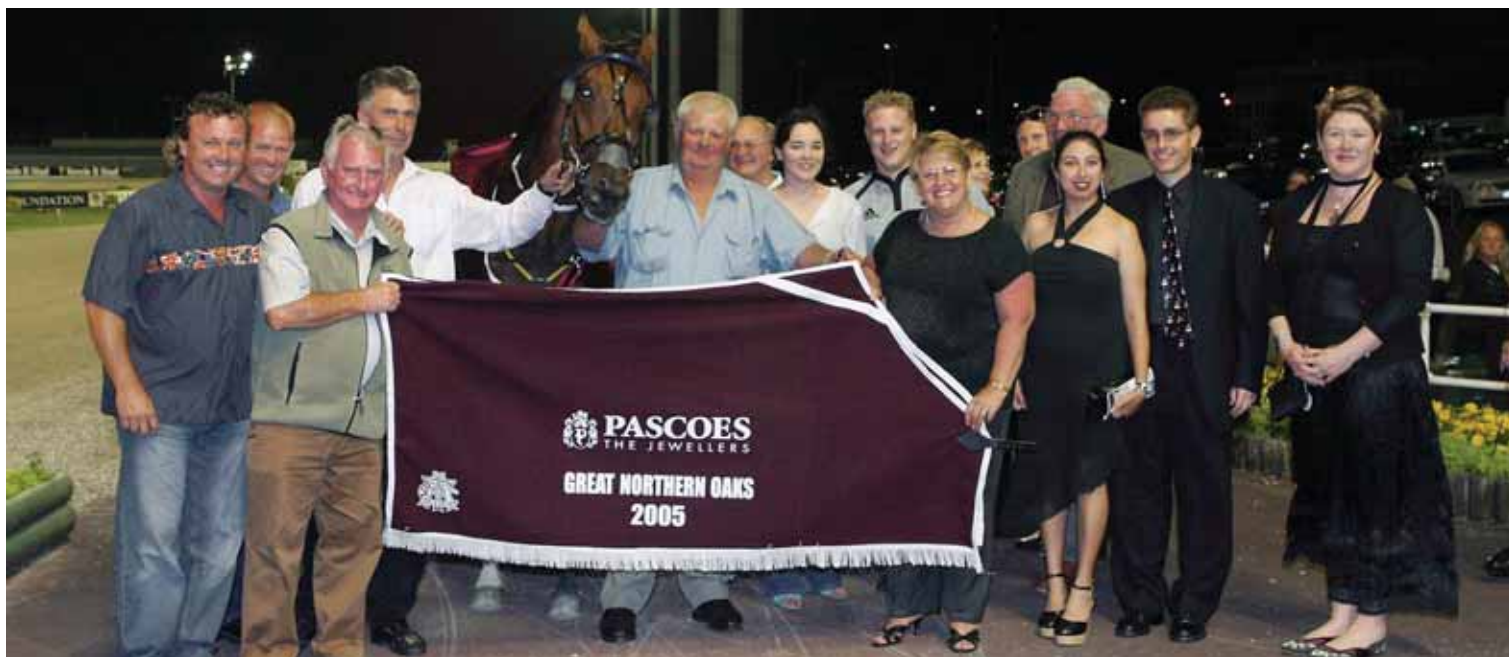
Tosti Girl, winner of the Pascoes Great Northern Oaks, 27 December 2005 and her connections.

Management is required to report to each monthly Board meeting in sufficient detail to enable the Board to assess progress against Annual Budgets, strategic goals and major projects.