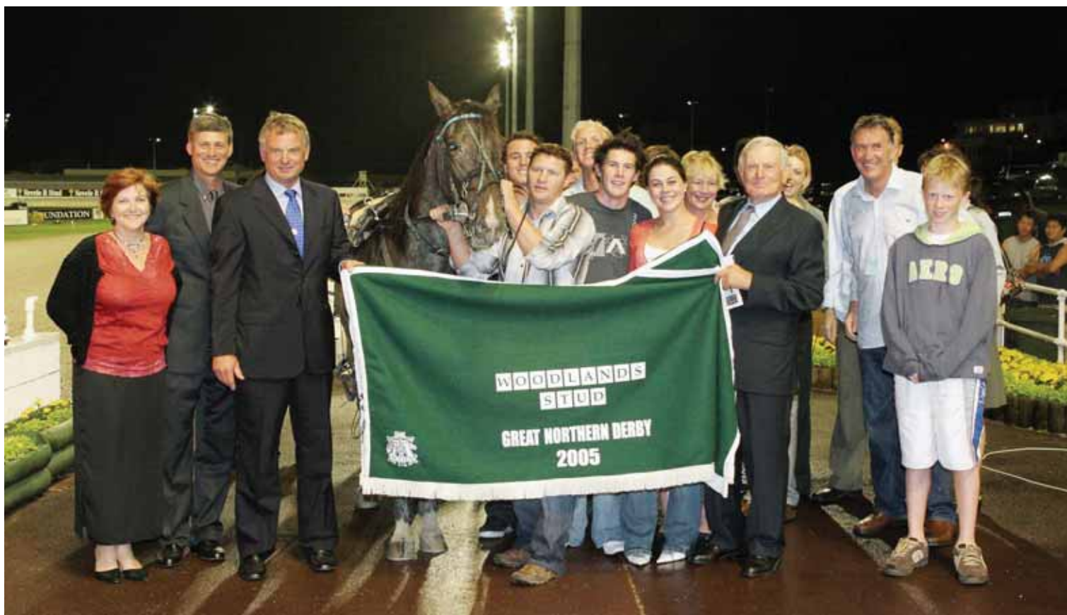
Monkey King, winner of the Woodlands Northern Derby, in the Winners' Circle - December 16 2005

FRONT COVER IMAGE: Mainland Banner in full flight at Alexandra Park